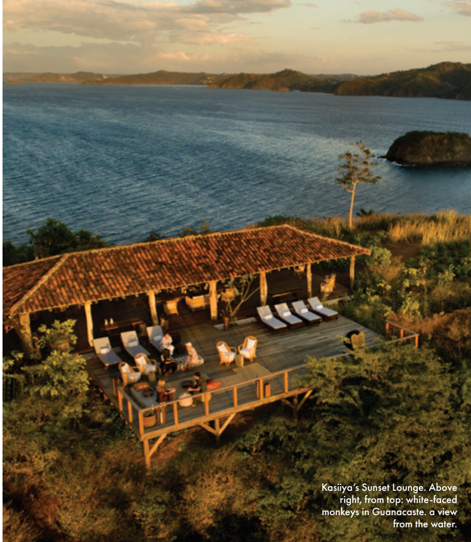
Kasiya's Sunset Lounge. Above right, from top: white-faced monkeys in Guanacaste, a view from the water.